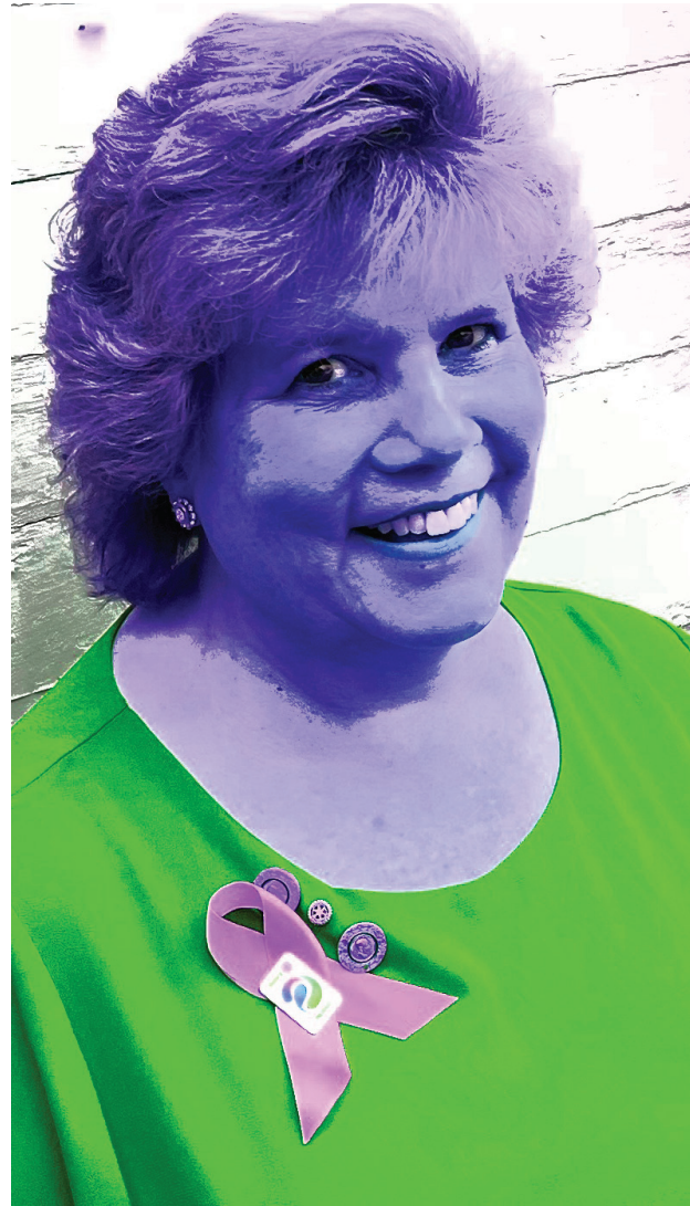
Violet Beauregard version of Moiph tweeking NOT TWERKING Prez Sue's picture took 30 seconds