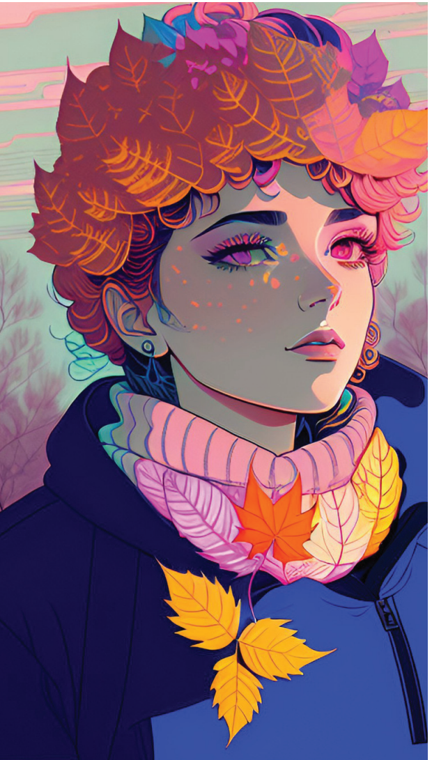
AI version with same photo but using Fall Leaves prompt and Anime menu took 30 seconds